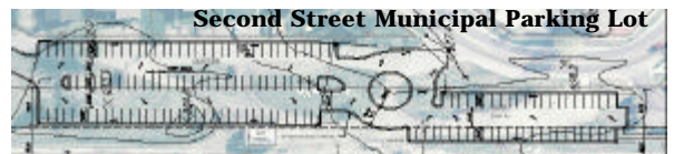
Second Street Municipal Parking Lot

A grant request to reprogram $400,000 in MSHDA Downtown Infrastructure Program funds from the previously approved North/West streetscape improvements to a complete upgrade of the Grand River/Main intersection is now under consideration. This project represents a second MSHDA grant in the amount of $400,000.